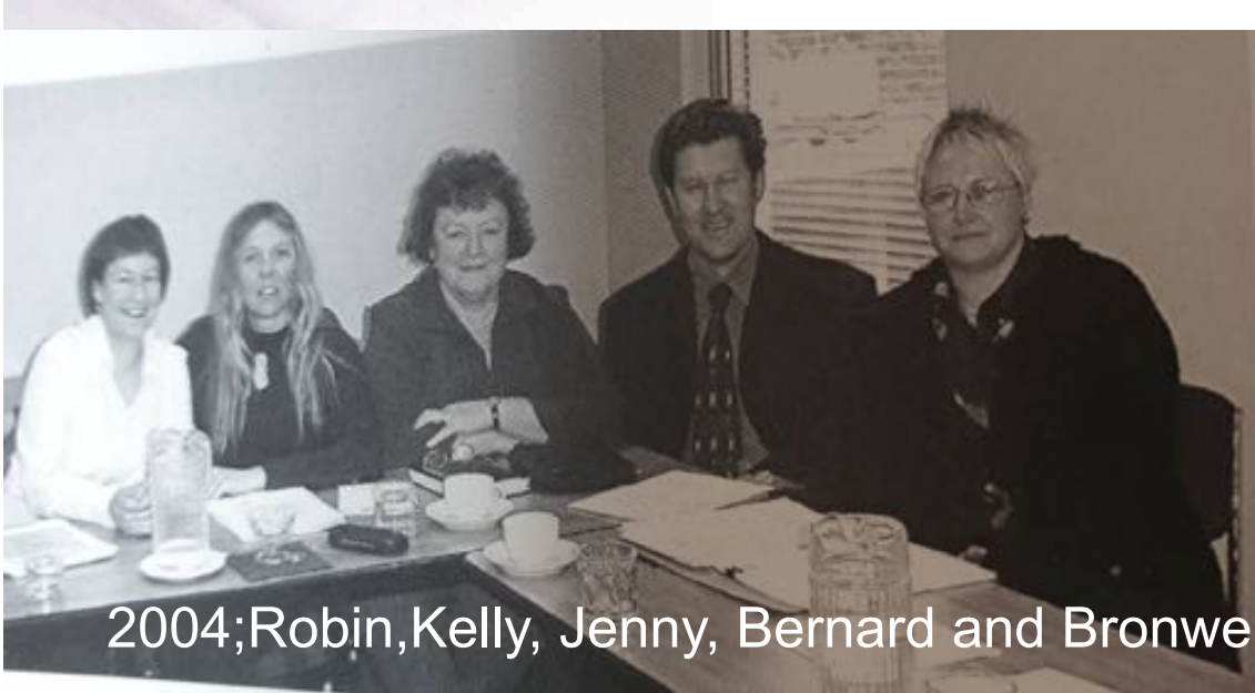
First negotiation Committee