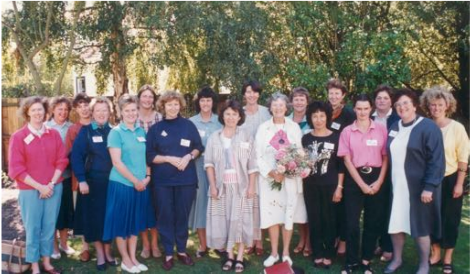
The Launch of the College of Midwives 1989